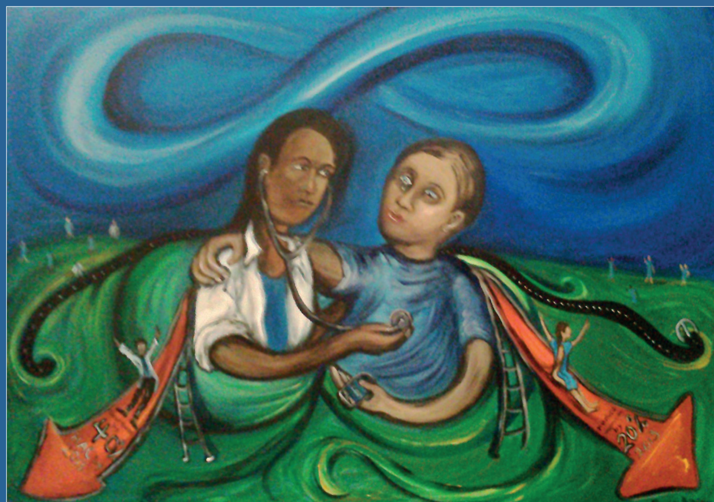
© Regina Holliday – Partnership with patient